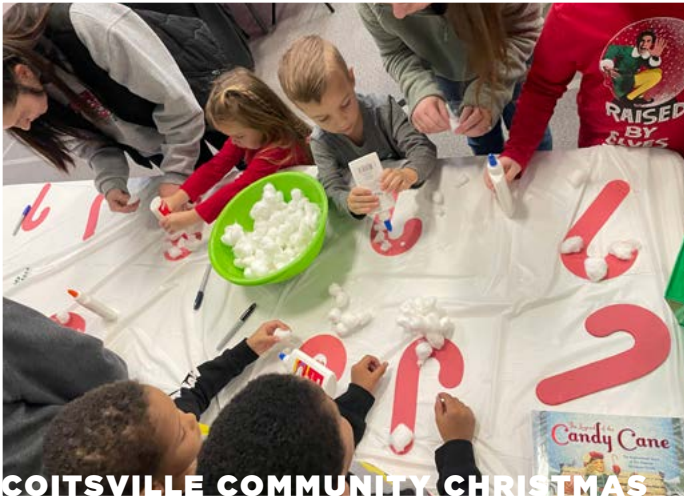
COITSVILLE COMMUNITY CHRISTMAS